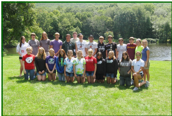
Midland Park Take Action Peer Leaders